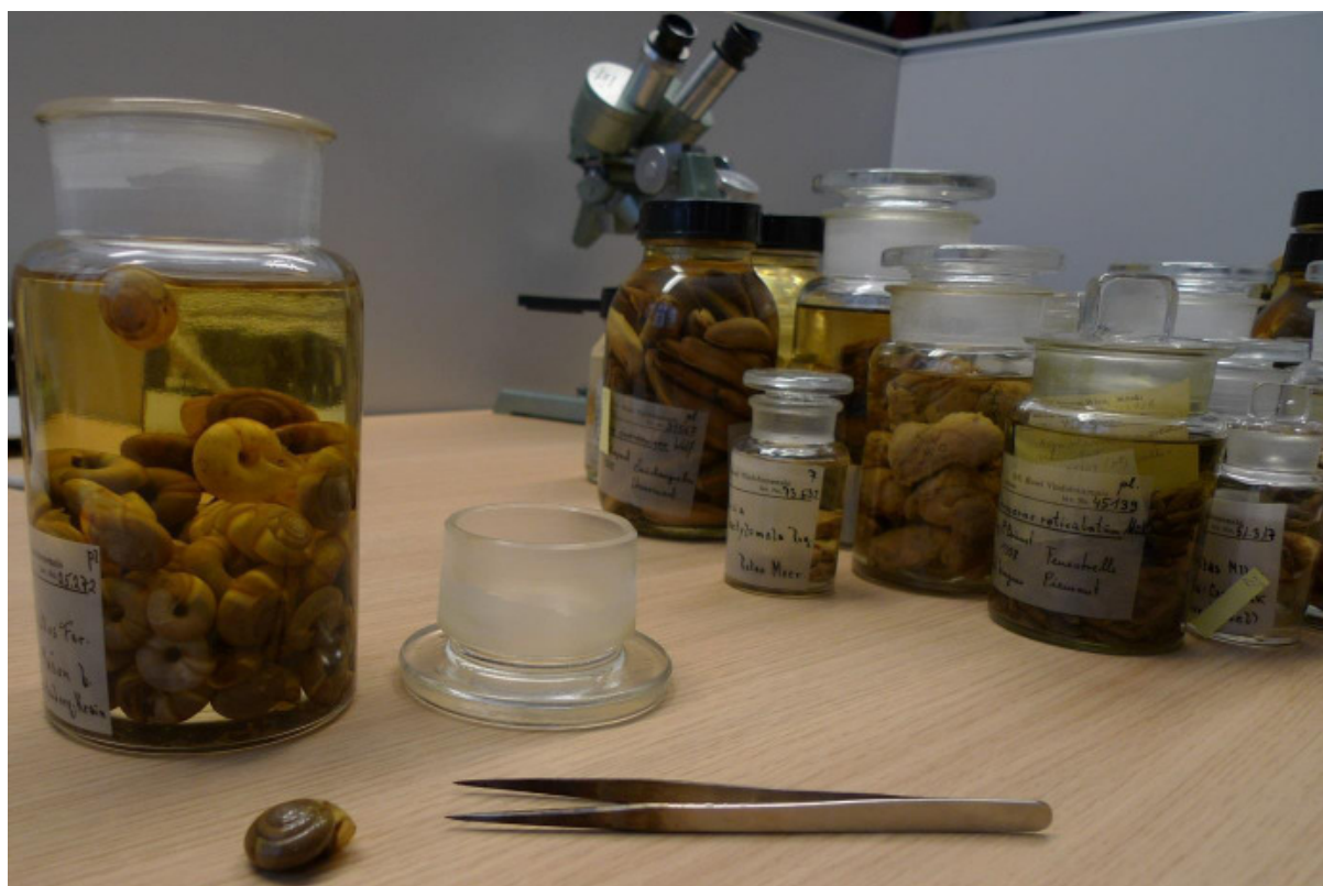
Museums collection; Photo: Katharina Jaksch