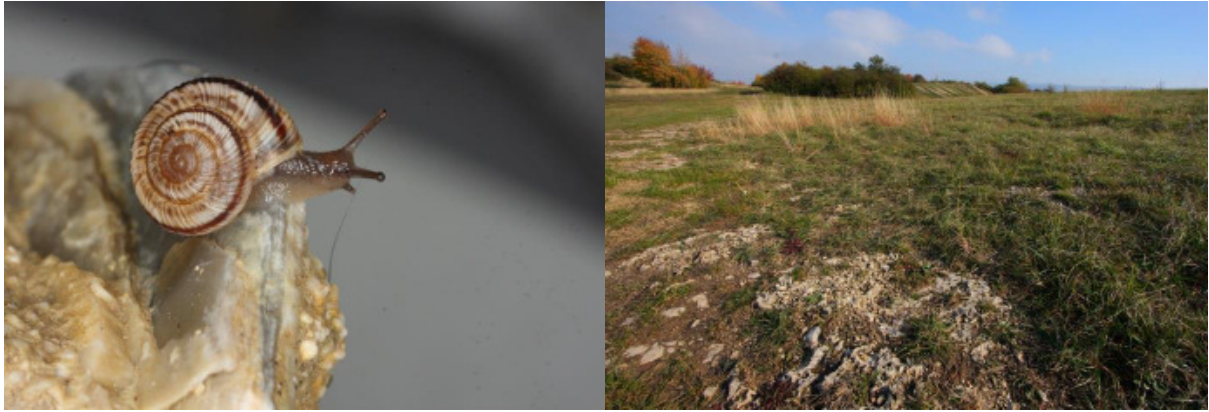
Live specimen of Helicopsis striata & habitat / Burgenland, Photos: A. Mrkvicka