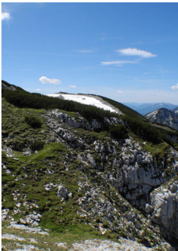
Plateau of the mountain Hoher Nock, which represents the highest elevation of the Sengsengebirge.

Combined with the apparent lack of introduced mollusc species, these results indicate the great importance of the national park for the conservation of autochthonous molluscan communities within Austria.