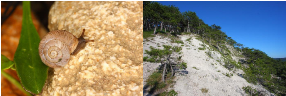
Live specimen of Helicopsis striata austriaca & habitat / Lower Austria

This project is funded by Burgenländische Landesregierung