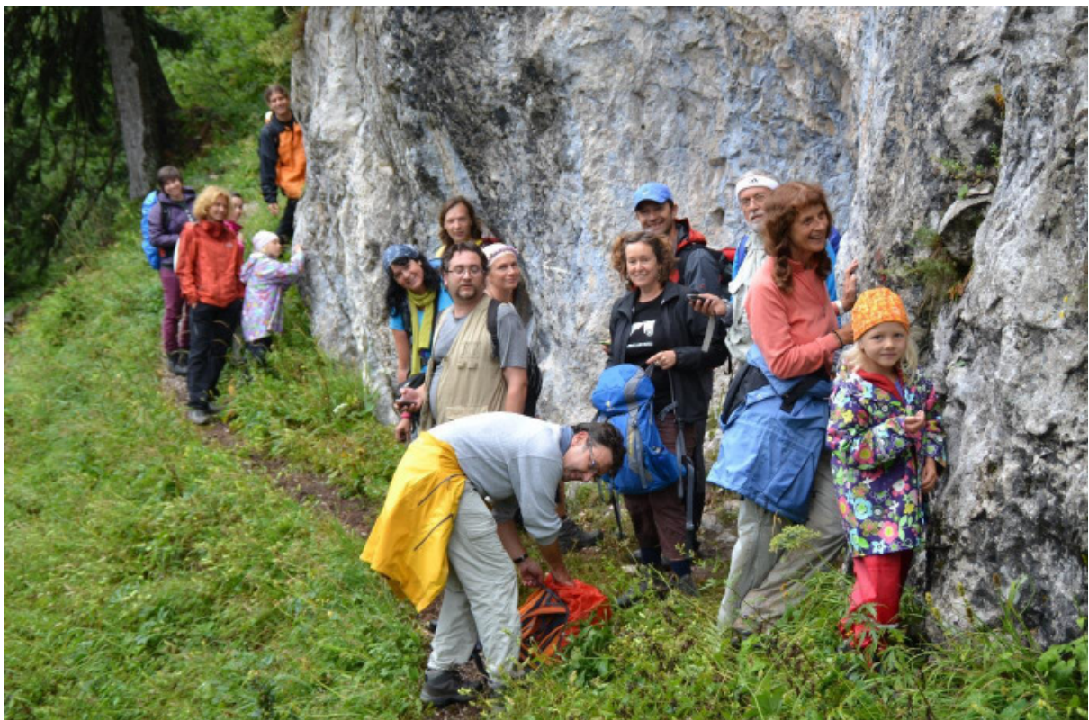
WORKSHOP ALPINE LAND SNAILS 2013; Photos: WG Alpine Landsnails