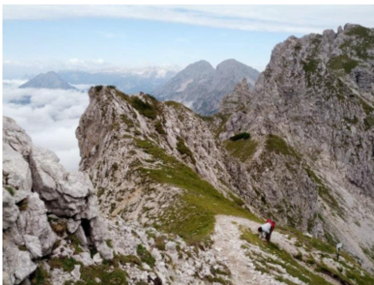
Natternriegel: sampling site in the eastern Haller Mauern; Photo: WG Alpine Landsnails

The next step will be to find out how far the hybridisation zone extends westwards to the Haller Mauern and to evaluate to which extent this hybridisation is also reflected in the morphological traits of the specimens analysed.