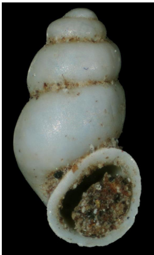
Bythiospeum nocki, a rare endemic and poorly known subterranean aquatic snail.